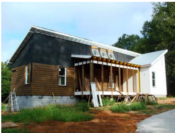
Fig. 4. DESIGNhabitat 2.1 View from Street