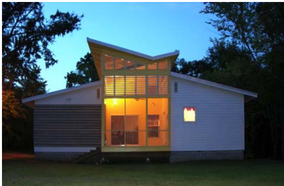
Fig. 2. DESIGNhabitat 2 View from Street