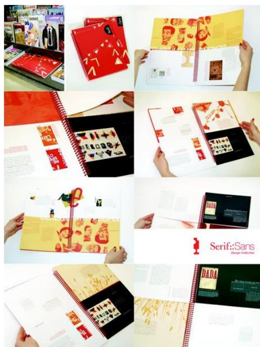
Graphic Design Production Design Senior Project